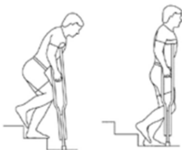
Figure 3: Going down stairs

When a railing is available hold both crutches in one hand or have someone hold the second crutch for you and have your other hand holding the railing. Move the crutches and railing hand forward, leading with your injured leg. Do not put weight on your injured leg if you are not allowed to. Follow with your uninjured leg.